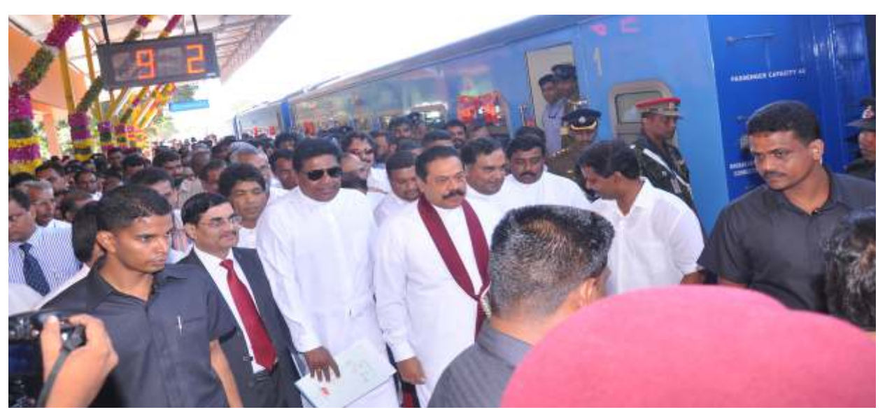
Commissioning of Omanthai-Kilinochchi section in Sri Lanka