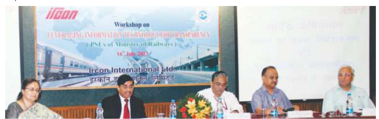
Workshop on Leveraging Information Technology for Transparency Organised at Ircon

The Department ensures implementation of laid down guidelines/procedures through preventive checks of tenders and contracts, execution of works, and other functions as well as carries out investigations into complaints. This year the Department carried out 8 inspections on various projects / units. Complaints raised against officials; procedures etc. by various Authorities (CVC/Railway Board Vigilance) and received from other sources were investigated to their logical conclusion. Based on the outcome, circulars on system improvements were issued in different spheres of working related to tenders, contracts, finance, etc., and also project management to avoid recurrence of irregularities / procedural errors and to plug loopholes. In addition, steps were taken for closure of paras raised by the Chief Technical Examiner's Organisation (CTEO). Scrutiny of immovable property returns of employees; creating awareness on rules/procedures/common irregularities in execution through workshops/trainings, debate competitions, etc. have been the prime activities of the Department.