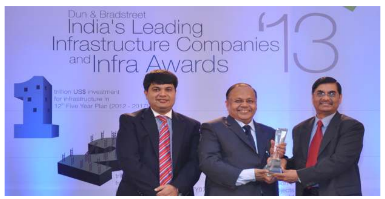
Top Infrastructure Company Award in Construction - Infrastructure Development - Mid