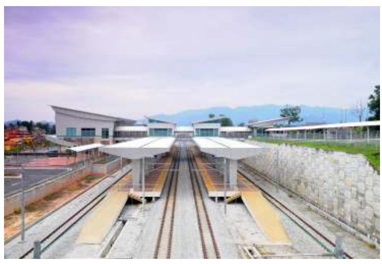
Rembau Railway Station, Malaysia

The entire double tracking project (about 98 km length between Seremban and Gemas on design and build basis including all electrification, signaling and communication works) in Malaysia -- being done for Ministry of Transport, Government of Malaysia, at a value of MYR 3366 million -- was completed on 31st July 2013, on the scheduled time. The project is now under two years maintenance period. This work is the largest ever transportation project under a single contract by any Indian company in a foreign country.