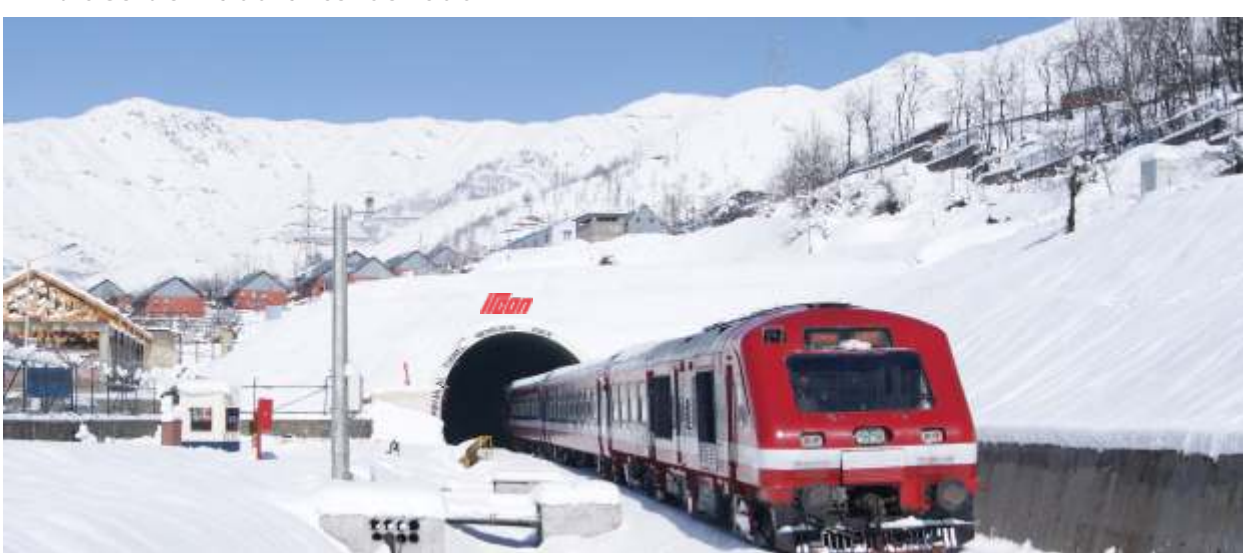
Train passing through 11 kms Pir Panjal Tunnel in J&K

(i) Pir Panjal tunnel and railway line from Banihal to Qazigund section connecting Kashmir with Jammu region and the rest of the Country was opened for passenger traffic on 26th June 2013. The first DEMU train from Banihal through the Pir Panjal Tunnel – the longest transportation tunnel in India – was flagged off by Dr. Manmohan Singh, the then Prime Minister of India, in the presence of dignitaries from the Govt. of India and Ircon's officials.