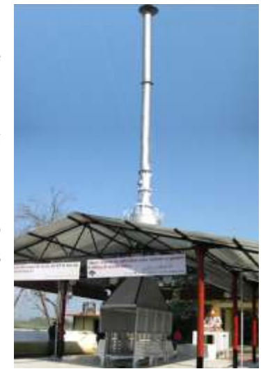
Mokshda Green Cremation Systems at Rae Bareli (UP)

To promote energy efficiency and provide environment friendly cremation system, two MOKSHDA Green Cremation Systems (MGCS), are being set up at Rae Bareli (U.P.), through NGO MOKSHDA as executing agency. This system consumes only 20% of fire wood in contrast to conventional cremation system, and thus reduces pollution and saves trees.