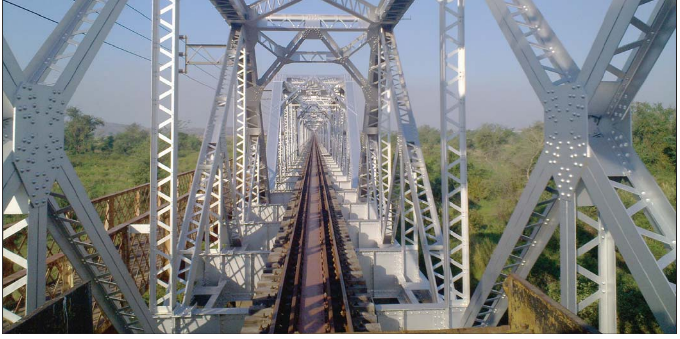
Rehabilitation of DONA ANA Bridge in Mozambique.