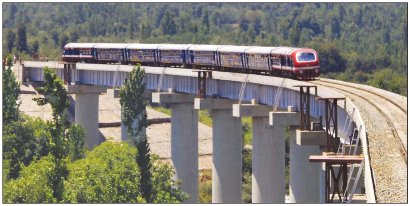
Diesel Multiple Unit on run J&K Project.