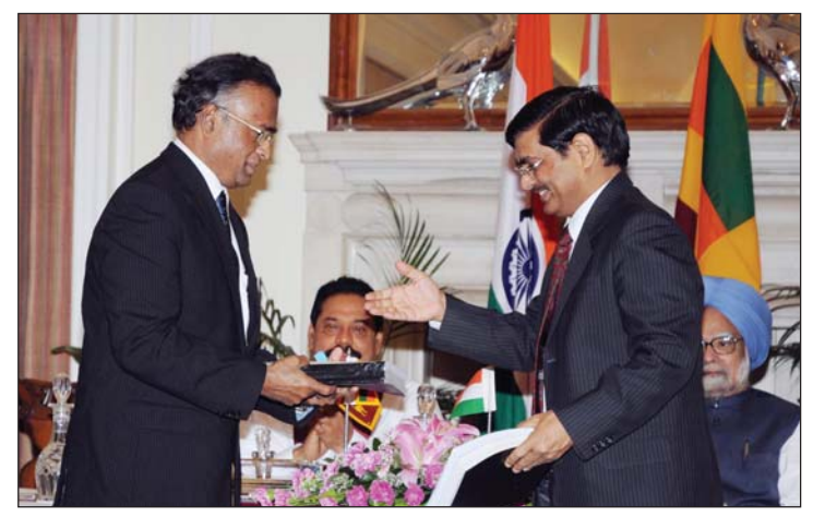
Signing of ageement by MD, Ircon in presence of President of Sri Lanka and Prime Minister of India

After the close of the year, your Company has signed in June 2010 a contract agreement with Government of Sri Lanka for restoration of railway line from Madhu Road to Talai Mannar, at a total value of USD 149.74 million. The contract will come into operation only after signing of loan agreement between EXIM Bank of India and Government of Sri Lanka.