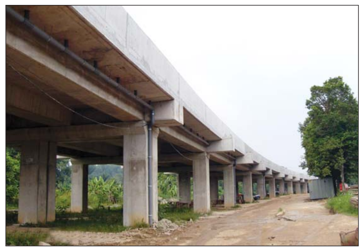
Viaduct - Malaysia Project

2. The Company was awarded a double tracking project (about 103 km length between Seremban and Gemas on design and build basis including all electrification, signaling and communication works) in Malaysia in December 2007 by Ministry of Railways, Government of Malaysia, at a value of ₹ 40840 million (about 1 billion USD). Physical works had started after detailed design in July 2008 as per schedule. Physical progress up to June 2010 is 47%. Though some initial delays took place due to non-availability of encumbrance free land at some locations, the work is likely to be completed by the target date of August 2012.