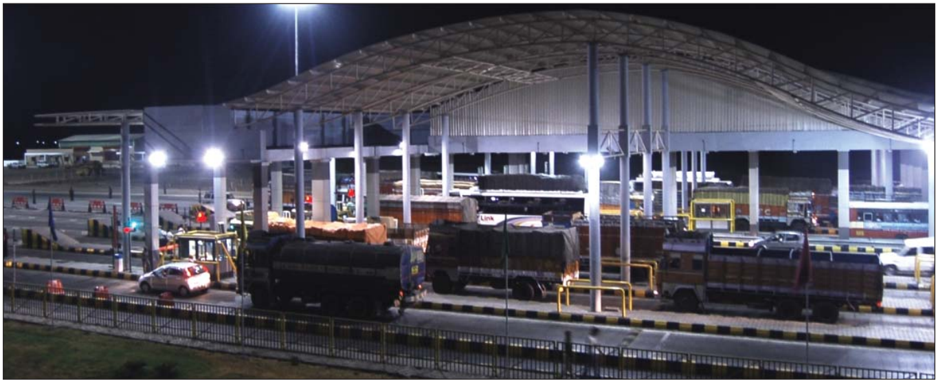
Toll Plaza - Dhule Pimpalgaon Project.

Your Company has pledged its present shareholding and has committed pledging of future shareholding in ISTPL in connection with a term loan of ₹ 4500 million taken by ISTPL from 8 banks, State Bank of India being the lead bank lender.