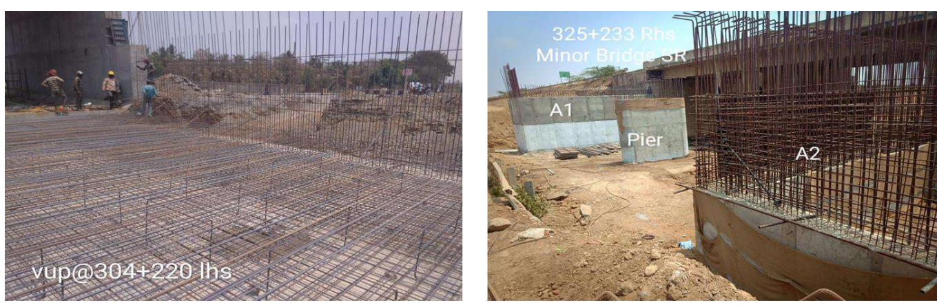
304+220 VUP Reinforcement in Progress