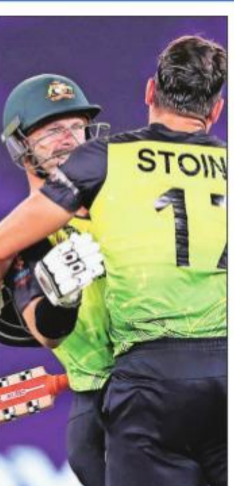
अबुधाबी में टी20 विश्वकप के दूसरे सेमीफाइनल में आस्ट्रेलिया के वेड और स्टोडनिस जीत के बाद खुशियां मनाते हुए।