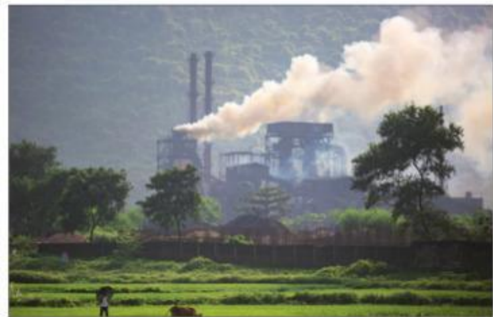
Smoke rises from a coal-powered steel plant at Hehal village near Ranchi earlier this year