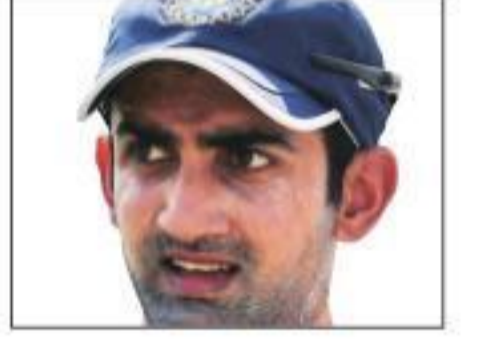
गंभीर ने भारतीय स्पिनर रविचंद्रन अश्विन को टैग करते हुए टि्वटर पर लिखा, 'वार्नर द्वारा खेल की भावना का काफी बुरा प्रदर्शन, शर्मनाक।'

अश्विन को अतीत में इंडियन प्रीमियर लीग के दौरान गेंदबाजी छोर पर जोस बटलर को रन आउट करने को खेल भावना के खिलाफ बताते हुए आलोचना झेलनी पड़ी है। गंभीर के ट्वीट के जवाब में किसी ने लिखा, 'आपका नजरिया सही नहीं है।' इस पर अश्विन ने टिप्पणी कि, 'उनका मानना है कि अगर वह सही था तो यह भी सही है। अगर वह गलत था तो यह भी गलत है। निष्पक्ष मूल्यांकन?' भारत के इस अनुभवी स्पिनर ने वार्नर को टैग करते हुए लिखा, 'वार्नर ने अद्भुत शाट खेला था। शानदार शाट।' वार्नर ने इस मैच में 30 गेंद में तीन चौके और इतने ही छक्के की मदद से 49 रन की पारी खेली। मैथ्यू वेड ने 19वें ओवर में लगातार तीन छक्के लगाकर टीम को पांच विकेट से जीत दिला दी।