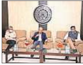
On the eve of IIT-D's 52nd convocation

"From November 29, we hope to start onboarding students and hopefully by the mid-