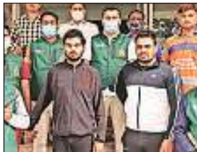
The men were arrested from outside Dwarka Sector-14 Metro station