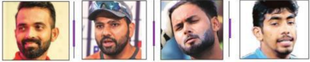
विराट कोहली की गैरमौजूदगी में रहाणे को कप्तान नव नियुक्त टी20 कप्तान और नियमित सलामी बल्लेबाज रोहित शर्मा, विकेटकीपर ऋषभ पंत और तेज गेंदबाज जसप्रीत बुमराह को कानपुर और मुंबई में दो टैस्ट मैचों के लिए आराम दिया गया है।

बीसीसीआइ सचिव जय शाह ने एक बयान में कहा, 'विराट कोहली दूसरे टैस्ट के लिए टीम से जुड़ जाएंगे और टीम की अगुआई करेंगे।' मध्यक्रम के बल्लेबाज श्रेयस अय्यर ने आफ स्पिनर जयंत यादव के साथ टैस्ट टीम में वापसी की है। टैस्ट श्रृंखला से पहले तीन मैचों की टी20 श्रृंखला खेली जाएगी जो 17 नवंबर को जयपुर में शुरु होगी। कोहली ने अवकाश लेने का फैसला किया है जिससे वह टी20