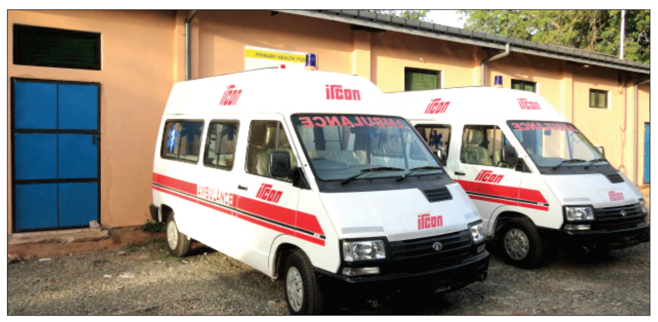
Health Unit Maintained at Medawachchiya in Sri Lanka under CSR Scheme

Your Company has a CSR Policy matching with its long term business plan in tune with CSR Guidelines issued by the Department of Public Enterprises.