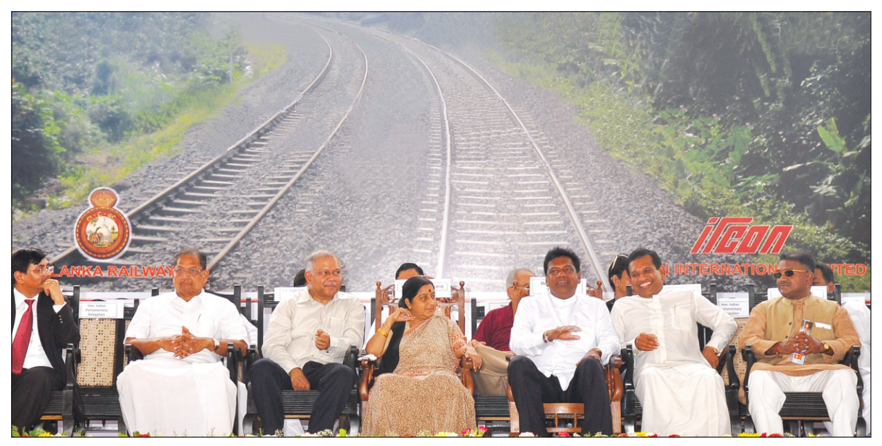
Commissioning of Upgraded Railway Track Kalutara - Galle - Matara Section

Phase-I of the project (Galle – Matara section) valued at USD 36.24 million got completed and passenger traffic was commenced on this section from 16<sup>th</sup> February 2011. The work on phase II (Kalutara – Galle) (at a value of USD 41.26 million) was taken up in October 2010. One section from Galle to Hikkaduwa was completed and opened for passenger traffic during the year on 19<sup>th</sup> January 2012. The work in the balance section (Hikkaduwa to Kalutara) has also been completed and the section has been opened for passenger traffic on 19<sup>th</sup> April 2012.