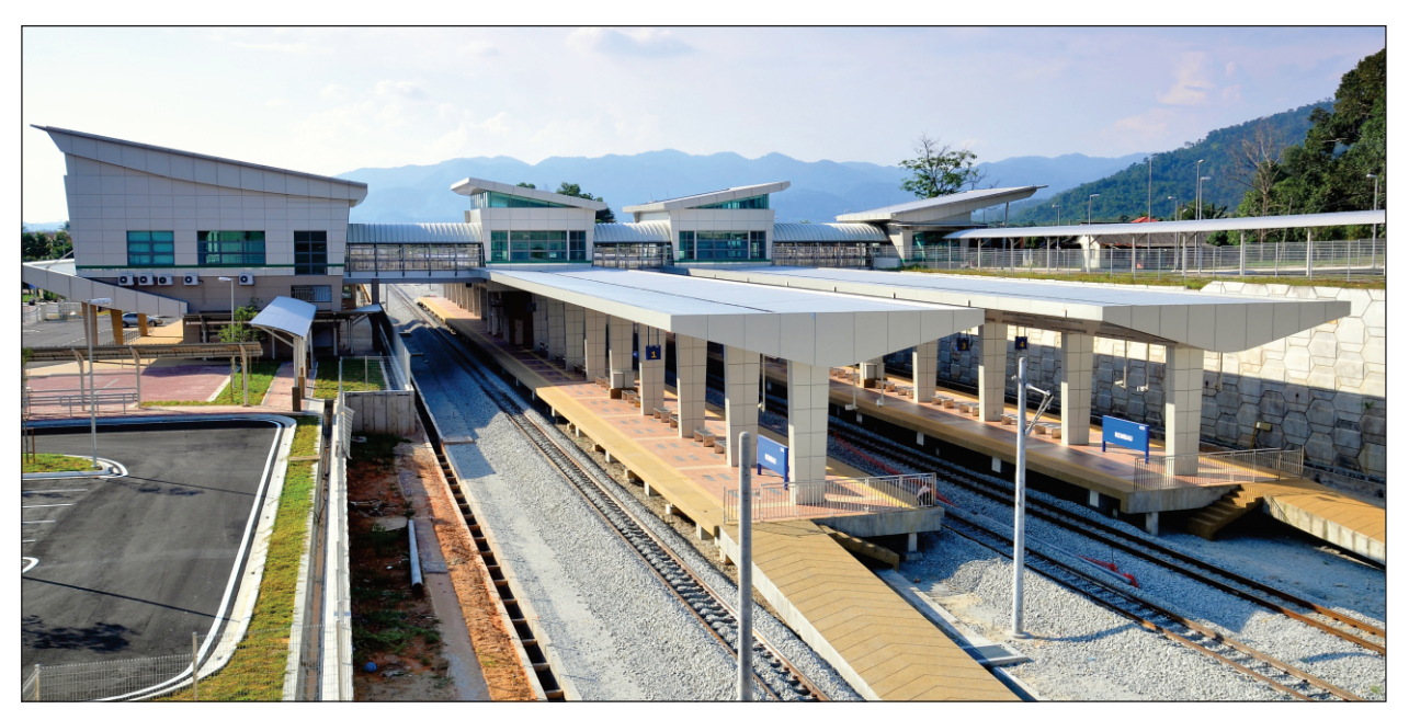
Rembau Station Building of Seremban-Gemas Electrified Double Track Project, Malaysia

1. Your Company continued to operate 25 meter gauge diesel locomotives on Malaysian Railway System (KTMB) as per the lease and maintenance contract, which has been extended up to 31<sup>st</sup> December 2012.