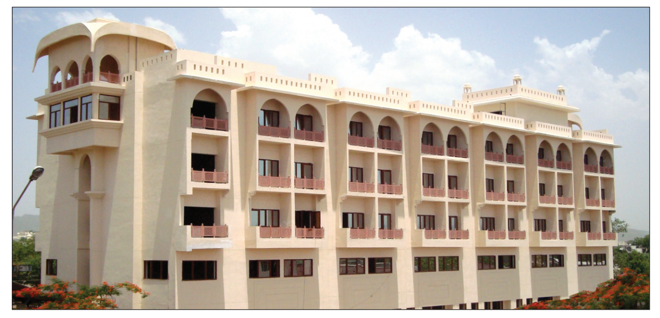
Multi Functional Complex at Udaipur

IrconISL also secured a project of Ministry of External Affairs for providing Consultancy Services for "Design Review and Re-Design of road section from Kaletwa to India-Myanmar border as per NH standards" at a total price of approximately ₹ 3 crores. IrconISL is also implementing identified projects of Corporate Social Responsibility of Ircon.