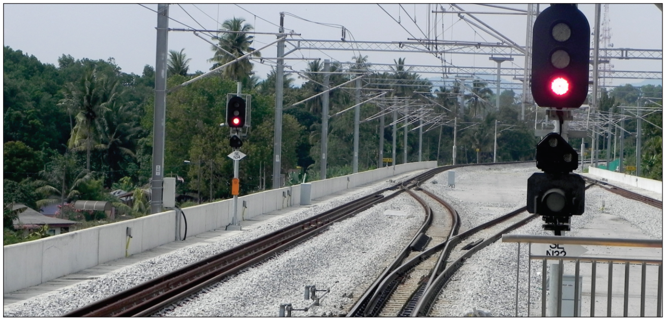
Sungai Gadut Yard - Ph-I of Seremban Gemas Double Tracking Project, Malaysia 8 Annual Report 2011-12

1. Your Company completed on 30<sup>th</sup> April 2011 the Seremban to Sungai Gadut section (Phase I of the USD 1 billion SGDT Malaysia project), at a value of USD 156 million. The commuter train operation was inaugurated and commenced from 24<sup>th</sup> May 2011.