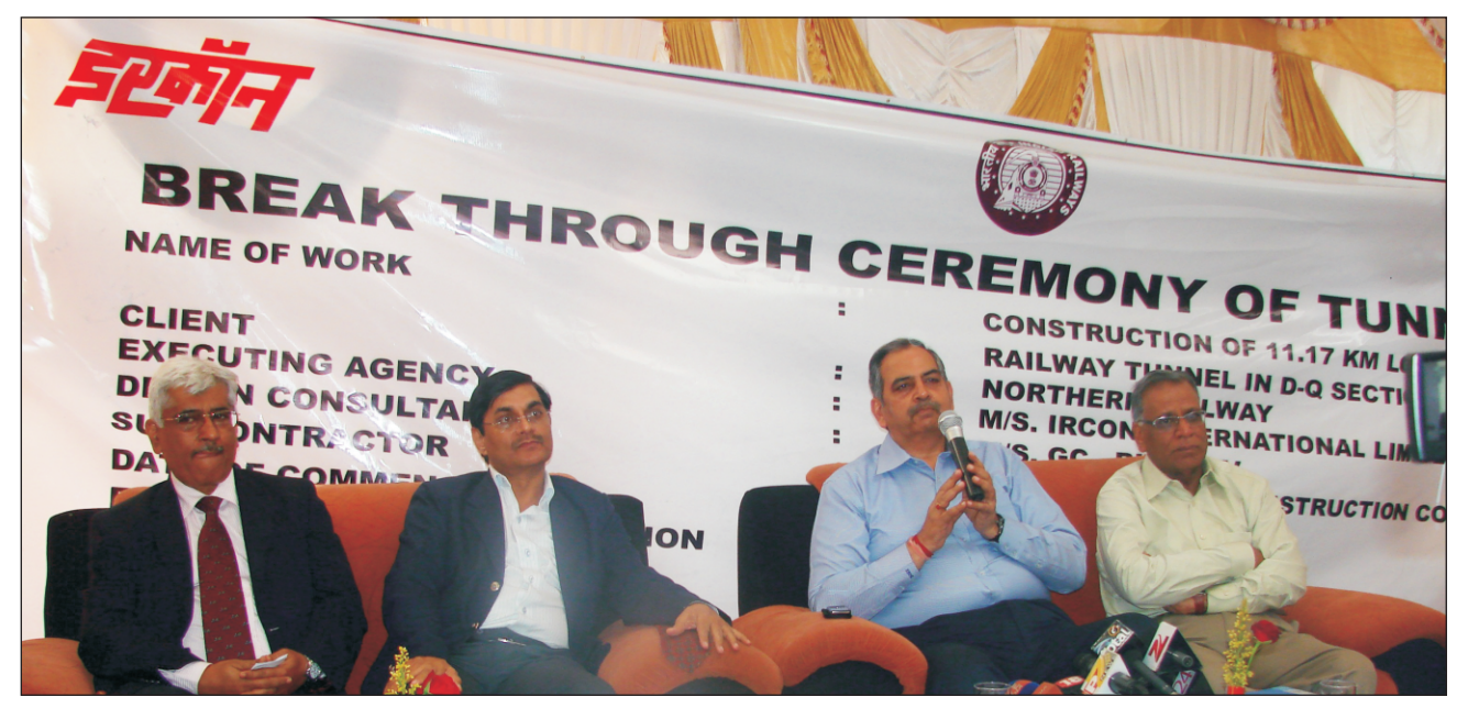
Breakthrough Ceremony of Tunnel T-80 (Pir Panjal Tunnel) J&K Rail Link Project