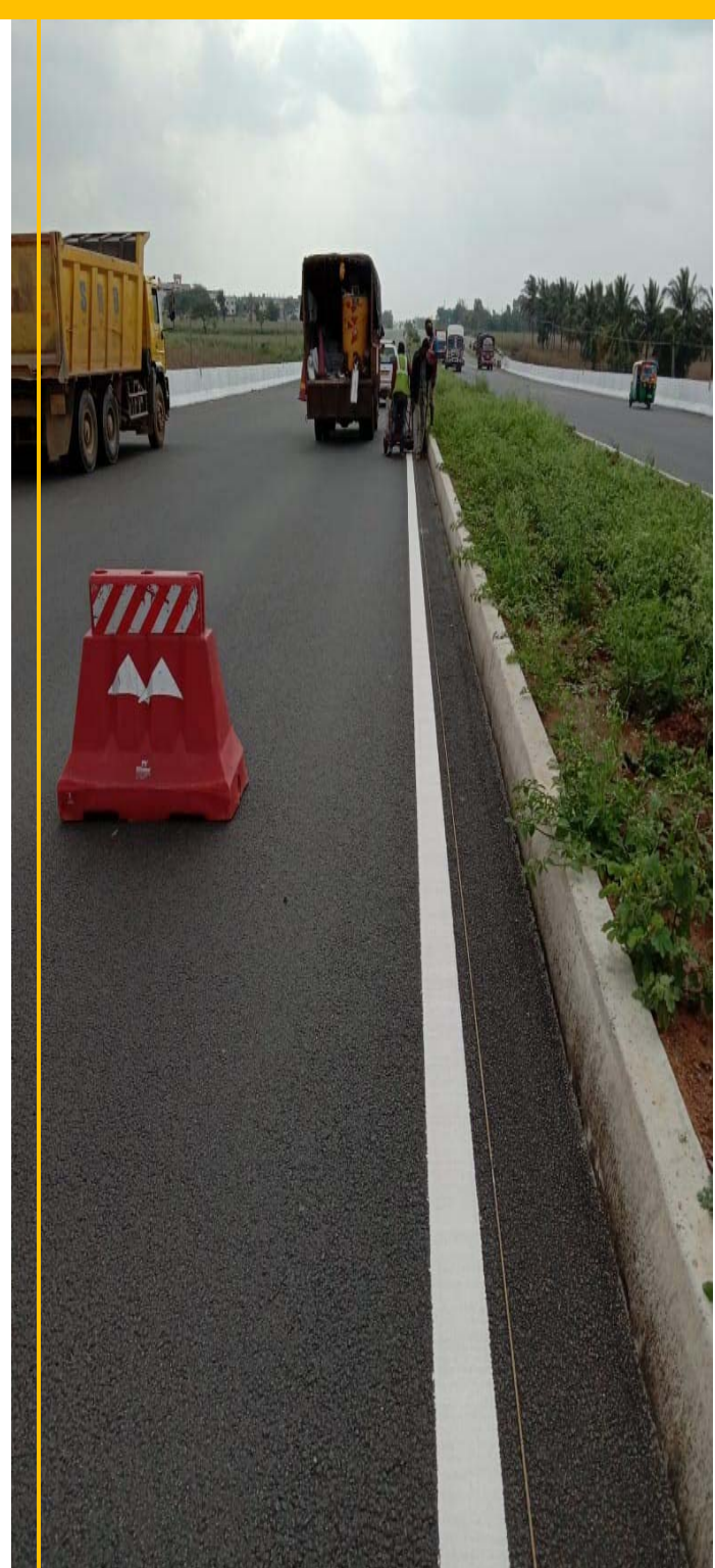
IrconDHHL- Annual Report 2020-21